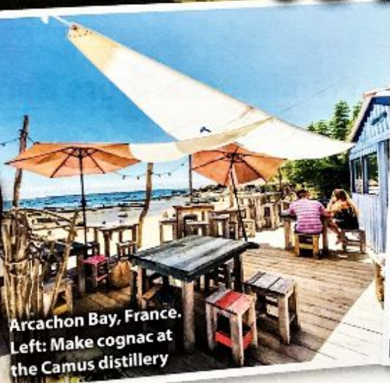
Arcachon Bay, France. Left: Make cognac at the Camus distillery