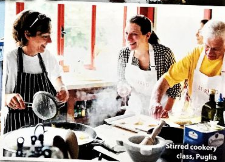
Stirred cookery class, Puglia

August, travelling between Paris and Epernay.