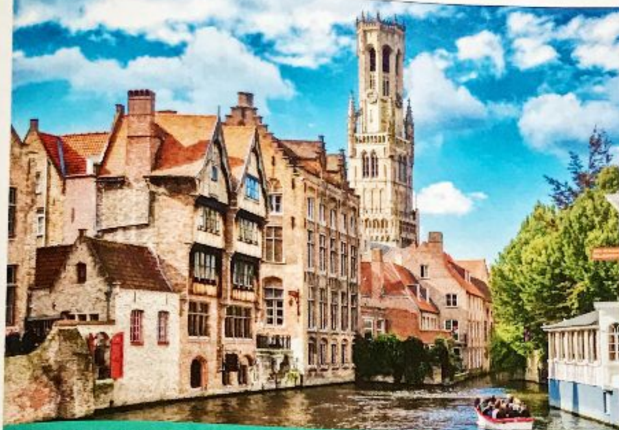
Clockwise, from above: Rozenhoedkaal in Bruges; Belgian beer in a traditional glass in Bruges; Tapas in Spain; A Cornish pasty; Port Isaac, Cornwall